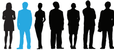
1 in 7 living in Los Angeles County live with food insecurity.

Each year, Los Angeles County unincorporated communities toss 128,000 tons of food into the trash. The Department of Public Works has partnered up with local charities in LA County to offer businesses a food donation option through Food DROP.